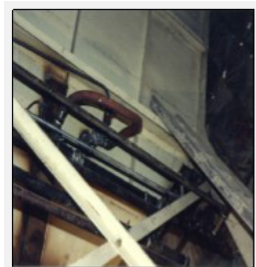
A 9' section of 2" header pipe was also installed to bring plant air to the AirSweep system. The system was tied into the main panel of the batch control, providing a simultaneous pulse firing of the solenoid as the gate opened.