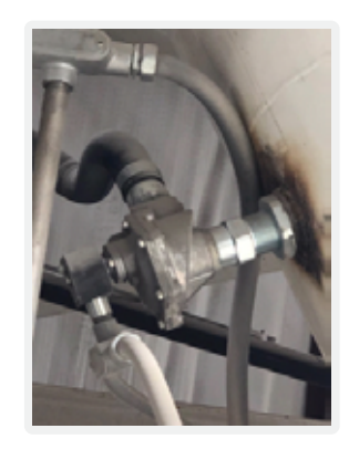
VA-12 Airsweeps® installed on the first bin for initial trial