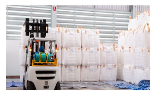
Forklift operator loads supersacks