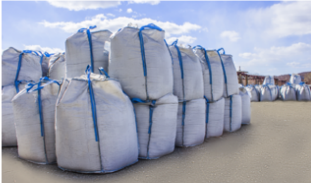
Supersacks filled and ready to go.

The operators stopped using sledgehammers, and production volume increased to the point that an additional forklift driver was hired to keep up with the output of finished product. After the initial trial, the company has since added the AirSweep® system to 16 additional product bins.