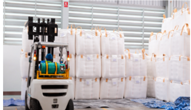
Forklift operator loads supersacks