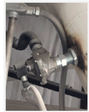
VA-12 Airsweeps® installed on the first bin for initial trial